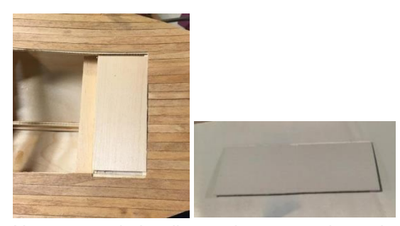
Next, to mask the diamond pattern, take a piece of metal screening, to scale, and stretch it diagonally and tape it over the piece of wood.