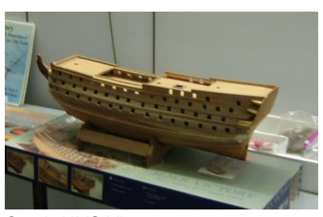
Corel: HMS Victory