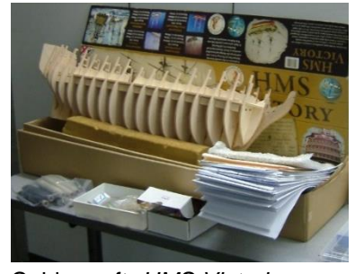
Caldercraft: HMS Victoria September 17, 2018

Surprise, there were not two partially built models but three. Besides the two Corel models, there was also a Caldercraft HMS Victory that he a purchased just prior to his death which he had framed up.